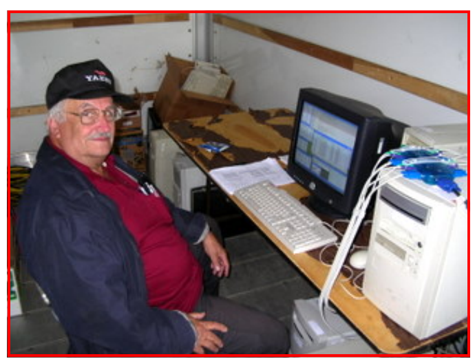
K3JJZ Computer / Networking Guru, setting up the log