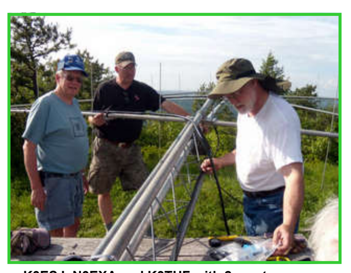
K3ESJ, N3EXA and K3TUF with 2m antennas