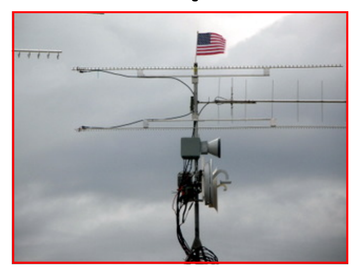
2304 and up, set to go