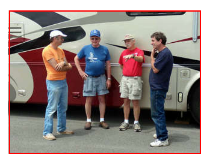
A short ragchew session before "Zero Hour"