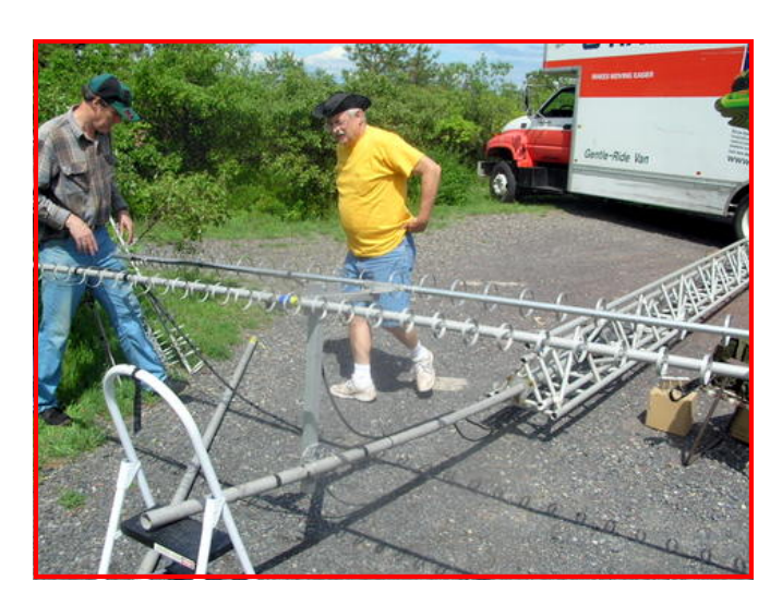
Setting up 903/1296 loopers