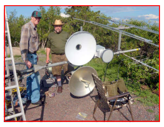
WA3RLT and WA3GFZ attaching the 10GHz feed