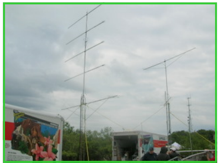
Layout of the operating trucks and most of the antennas. Note the ominous sky which will pour down and shake the ground any minute