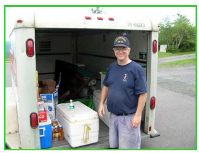
KB3NRL unloading some of the weekend's food and supplies