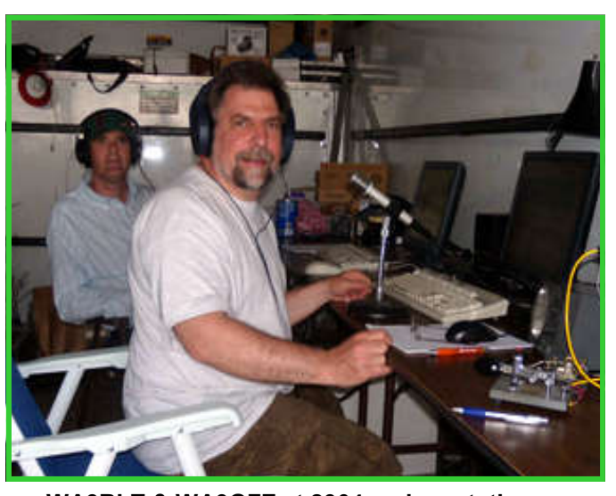
WA3RLT & WA3GFZ at 2304 and up station

Thanks to WA3SRU, K3JJZ and K1DS for the pix.See http://www.packratvhf.com/June%20Contest%202009/pictures/dscn0814.html for more.