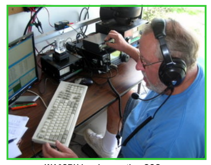
WA3SRU logging another QSO